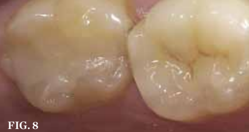
CATEGORY 2 CLINICAL EXAMPLE (7.) Preoperative photograph of an inlay in tooth No. 18 and an onlay on tooth No. 19. (8.) Postoperative photograph showing a non-layer material in use.