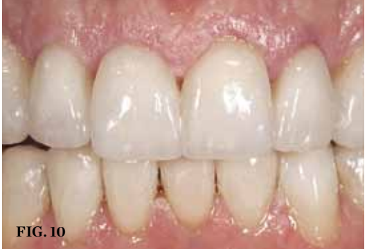
CATEGORY 2 CLINICAL EXAMPLE (9.) Preoperative photograph of a case requiring significant lengthening. There is at least medium risk of flexure and unfavorable stress, and some of the substrate would be dentin. Thus, Category 1 materials were eliminated as a choice. (10.) Postoperative photograph after Category 2 materials were applied, with minimal porcelain layering in the incisal one third.