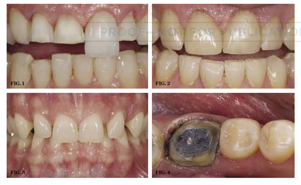
CLINICAL EXAMPLES OF EVALUATION PARAMETERS (1.) Image of the prepared tooth. Significant dentin is exposed. The proposed length flexure and tensile stress risk is at least medium and the restoration thickness would be at least 0.9 mm. This was noted in the chart. (2.) Image demonstrating excessive enamel crazing, leakage, and staining. Flexure, tensile, and shear risks would be medium to high. The substrate would depend on preparation. (3.) Image demonstrating a deep overbite in which shear and tensile stresses would be at least medium. Bonded porcelain would require maintenance of enamel and an occlusal strategy to reduce leverage on the teeth. (4.) Image of a preparation with a poor substrate and subgingival margins where maintaining the seal would be difficult. High-strength ceramics or metal-ceramics would be indicated.

will be attached (Figure 1). Is it enamel? How much of the bonded surface will be enamel? How much enamel is on the tooth? Is it dentin? How much of the bonded surface will be dentin? What type of dentin will the restoration be bonded to (ie, tertiary or sclerotic dentin exhibits very poor bond strength, and bonding to this type of dentin should be avoided when possible)? Is it a restorative material (eg, composite, alloy)? These questions should be addressed for each tooth to be restored because this will be one major parameter for material selection. It is generally understood and accepted that predictable and high bond strengths are achieved when restorations are bonded to enamel, given the fact that the stiffness of enamel supports and resists the stresses placed on the materials in function. It is equally understood that bonding to dentin surfaces-as well as to composite substrates-is less predictable given the variability and flexibility of these substrates. The more stress placed on the bonds between dentin and composite substrates and the restoration, the more damage is likely to occur to the restoration and underlying tooth