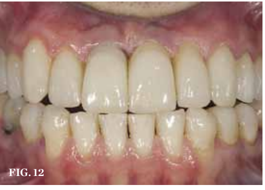
CATEGORY 2 CLINICAL EXAMPLE (11.) Preoperative photograph of a case in which the patient refused surgery and orthodontics. The treatment goal was to do minimal preparation and use a tough material due to the general medium-to-high risk in every area; obtaining a seal was possible. (12.) Postoperative photograph with bonded full-contour restorations in place on the posterior teeth and incisally layered anterior teeth.