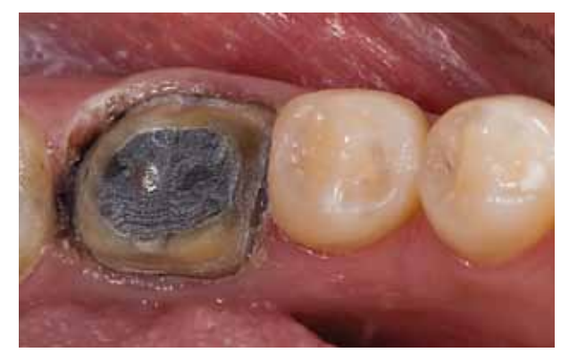
Figure 4 Image of a preparation with a poor substrate and subgingival margins where maintaining the seal would be difficult. High-strength ceramics or metal-ceramics would be indicated.

Figure 3 Image demonstrating a deep overbite in which shear and tensile stresses would be at least medium. Bonded porcelain would require maintenance of enamel and an occlusal strategy to reduce leverage on the teeth.