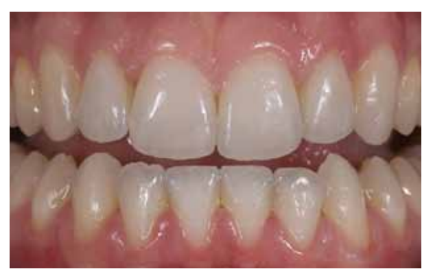
Figure 6 Two-year postoperative image of very conservative Category 1 bonded porcelain restorations.

in high-stress areas such as the margins) is recommended when restoring using powder/liquid materials (Category 1). By increasing the presence of enamel, the prognosis is improved. Depending on the dentin/enamel ratio, the risk can be assessed between low to moderate.