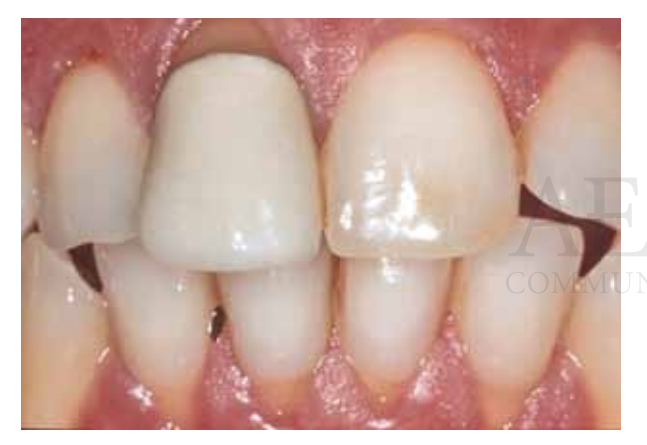
Figure 13 Preoperative photograph of an old, unesthetic PFM.

Summary: Pressed or machined glass-ceramic material such as Empress, Vitablocs Mark II, and Authentic are indicated