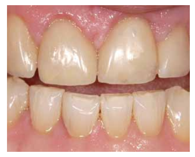
Figure 2 Image demonstrating excessive enamel crazing, leakage, and staining. Flexure, tensile, and shear risks would be medium to high. The substrate would depend on preparation.

The third parameter is the risk (or amount) of ongoing shear and tensile stresses that the restoration will undergo, because