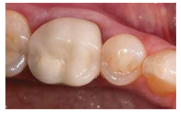
Figure 15 Preoperative photograph of an old PFM. The patient was unhappy with the opacity and metal display at the margin. Category 3 or 4 material is required for this case.