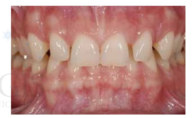
Figure 3 Image demonstrating a deep overbite in which shear and tensile stresses would be at least medium. Bonded porcelain would require maintenance of enamel and an occlusal strategy to reduce leverage on the teeth.

Bonded pure porcelain restorations are ideal as the most conservative choice but are the weakest materials and require specific clinical parameters to be successful.<sup>13</sup> Many good materials and techniques are available for bonded porcelain (eg, Creation, Jensen Dental, www.jensendental.com; Cermaco<sup>®</sup> 3, Dentsply, www.dentsply.com; EX-3, Noritake, www.noritake-dental.co.jp). The authors use Vita<sup>®</sup> VM 13 (Vita Zahnfabrik, www.vita-zahnfabrik.com) when 3-D master shades are taken and Halo (Shofu, www.shofu.com) when classic shades are taken. When following clinical parameters and guidelines at the UCLA Center for Esthetic Dentistry, the authors have observed similar success rates with these materials when compared with porcelain-fused-to-metal