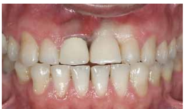
Figure 11 Preoperative photograph of a case in which the patient refused surgery and orthodontics. The treatment goal was to do minimal preparation and use a tough material due to the general medium-to-high risk in every area; obtaining a seal was possible.