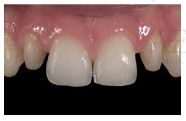
Figure 5 Image of minimal preparations prior to application of the bonded porcelain.

1. Substrate condition: A rate of 50% or more remaining enamel is on the tooth, 50% or more of the bonded substrate is enamel, and 70% or more of the margin is in enamel. These percentages are subjective assessments based on an overall evaluation of all parameters affecting the teeth to be restored and may influence material selection. If bonding to some dentin substrate, the dentin should be mostly unaffected and superficial because sclerotic dentin exhibits very poor bond strength. 2. Flexure risk assessment: A higher-risk and more guarded prognosis is presented when bonding to dentin. Due to dentin's flexible nature, avoiding the use of low-fracture resistance restorative materials is recommended; therefore, the presence of a higher percentage of enamel (ie, at least 70%