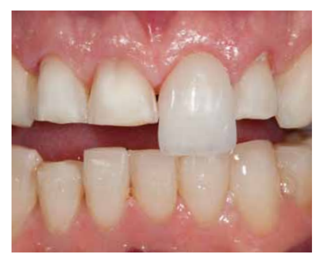
Figure 1 Image of the prepared tooth. Significant dentin is exposed. The proposed length flexure and tensile stress risk is at least medium and the restoration thickness would be at least 0.9 mm. This was noted in the chart.

Next is the flexure risk assessment. Each tooth and existing restoration is evaluated for signs of past overt tooth flexure. Signs of excessive tooth flexure can be excessive enamel crazing (Figure 2), tooth and restoration wear, tooth and restoration fracture, microleakage at restoration margins,