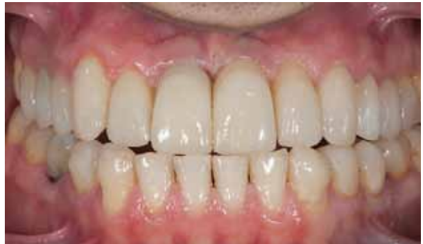
Figure 12 Postoperative photograph with bonded full-contour restorations in place on the posterior teeth and incisally layered anterior teeth.