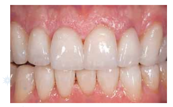
Figure 10 Postoperative photograph after Category 2 materials were applied, with minimal porcelain layering in the incisal one third.