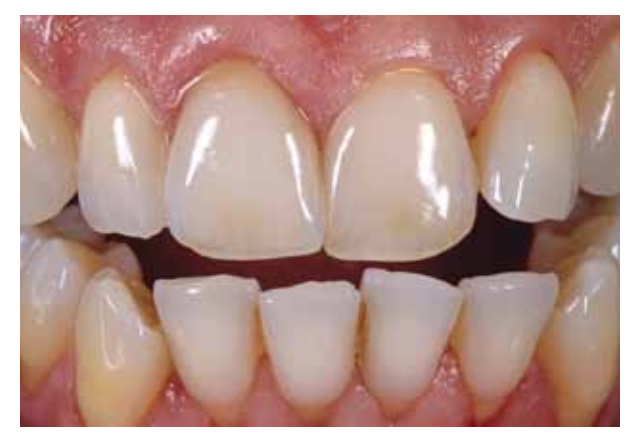
Figure 14 Postoperative photograph of a high-alumina crown system.

for thicker veneers, anterior crowns, and posterior inlays and onlays (Figure 7 and Figure 8) in which medium or lower flexure risks and shear and tensile stress risks are documented (Figure 9 and Figure 10). Also, they are indicated only in clinical situations in which long-term bond and seal can be maintained. IPS e.max (Figure 11 and Figure 12), which is a different type of glass-ceramic that has higher toughness, is also indicated for the same clinical situations as the other glass-ceramics but can be extended for single-tooth use in higher-stress situations (as in molar crowns). This is provided it is used in a full-contour monolithic form and cemented with a resin cement.