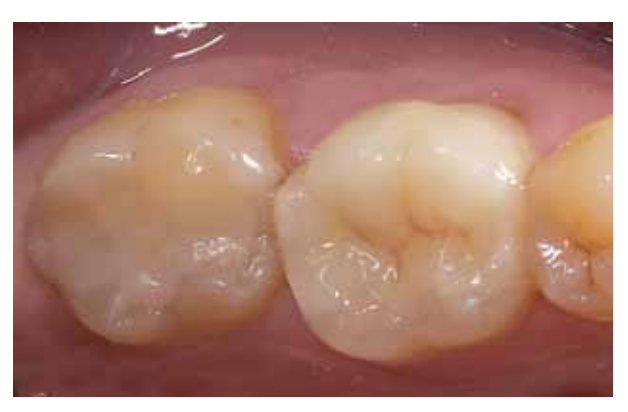
Figure 8 Postoperative photograph showing a nonlayer material in use.