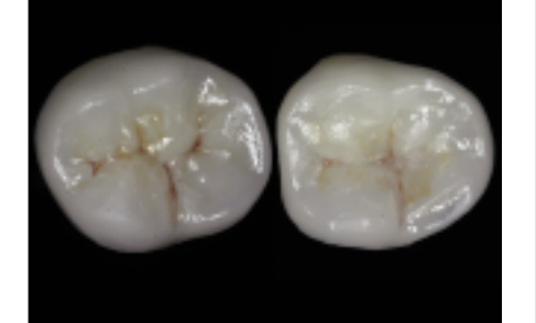
Figure 13. Completed restorations after stain and glaze.