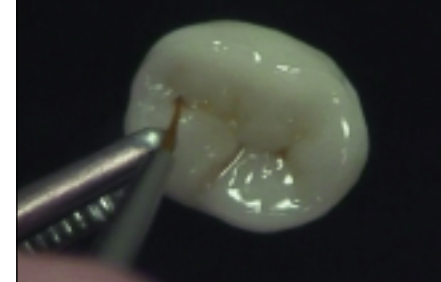
Figure 12. Stain and glaze.