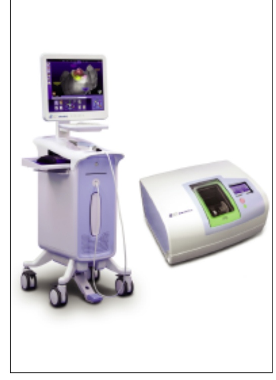
Figure 2. The D4D Dentist System.