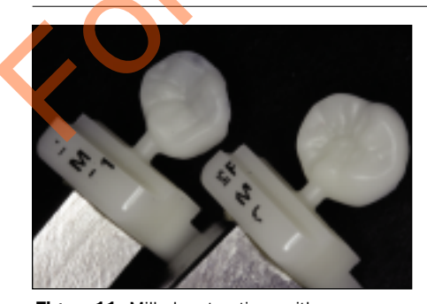
Figure 11. Milled restorations with sprue.

When the final virtual restoration has been completely designed, it is simply a matter of loading the milling chamber with the predetermined shade and size of ceramic (or