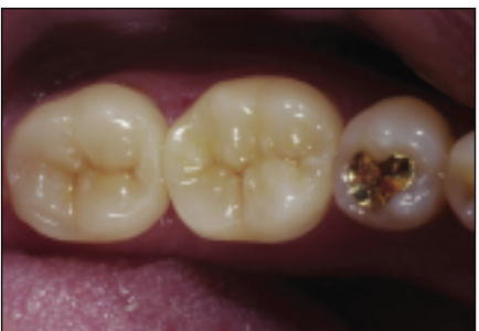
Figure 14. Final restorations after bonding.