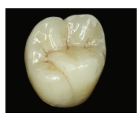
Figure 5. CAD/CAM-created restoration.