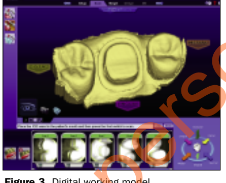
Figure 3. Digital working model.

In the conventional indirect restorative process, the procedure began with the usual steps: the clinician prepared the case according to the appropriate preparation guidelines, took impressions, and then sent these and other critical pieces of information to the laboratory. In the laboratory, the impression was poured, the models mountcontinued on page 116