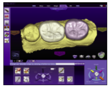
Figure 10. Digital onlay design. continued on page 116