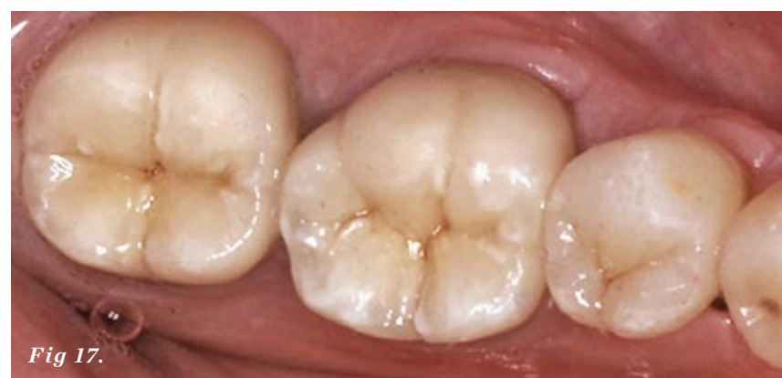
Fig 17. Postoperative photograph of teeth Nos. 18 to 20 in a case with subgingival margins.