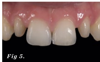
Fig 5. Image of minimal preparations prior to receiving bonded porcelain.

1. Substrate condition : A rate of 50% or more remaining enamel is on the tooth, 50% or more of the bonded substrate is enamel, and 70% or more