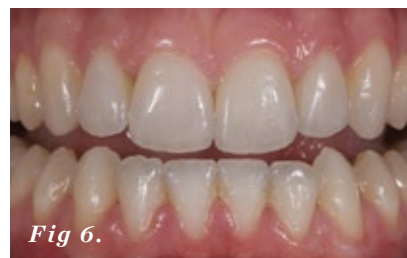
Fig 6. Two-year postoperative image of very conservative Category 1 bonded porcelain restorations.

1) Generally indicated for anterior teeth; 2) occasional bicuspid use and rare molar use would be acceptable only with all parameters at the least-risk level. Category 1 materials are ideal in cases with significant enamel on the tooth and generally with low flexure and stress risk assessment. These materials absolutely require long-term bond maintenance for success.