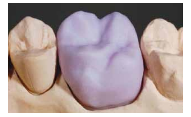
Figure 12 A milled e.max full-contour posterior restoration, shown in the "blue" stage.