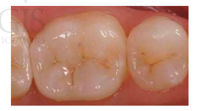
Figure 2 The mandibular molar was restored with a CAD/ CAM and milled e.max restoration, using a stain and glaze technique for esthetics.