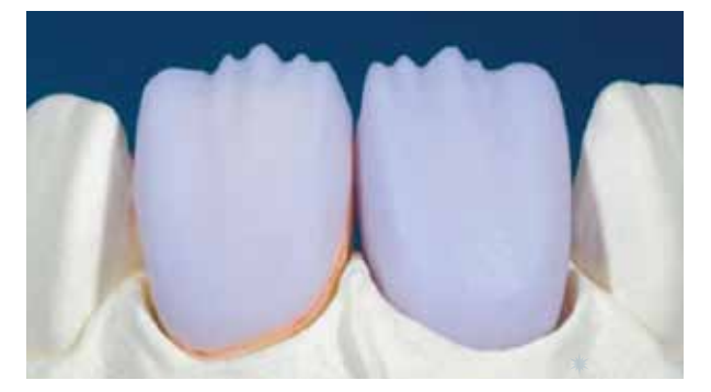
Figure 14 A milled e.max "cut back" anterior restoration, shown in the "blue" stage.