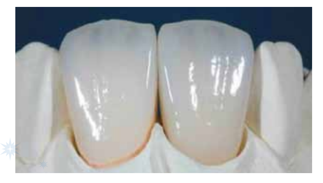
Figure 15 A milled e.max "cut back" anterior restoration, shown in the final "crystallized" microlayered and glazed stage.