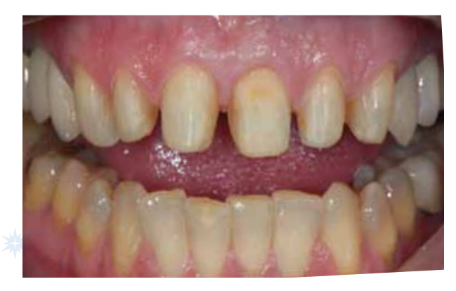
Figure 6 Veneer preparations for the anterior restorations.