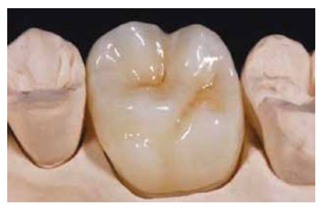
Figure 13 A milled e.max full-contour posterior restoration, shown in the final "crystallized" stain and glaze stage.