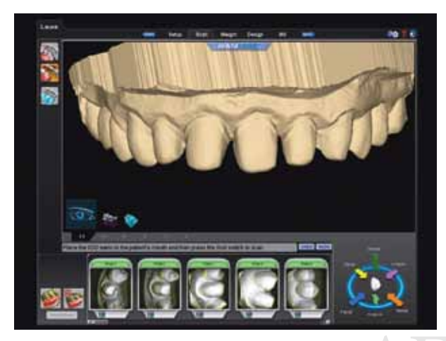
Figure 8 Computerized image of the digital 3-D model.

mounted, and the dies are trimmed. Appropriate restorations—layered, pressed, milled, cast, or combinations—are made. However, as restorative dentistry shifts further into the digital era, clinicians must change their perceptions and definitions of the dental laboratory. Traditionally, a laboratory is the site that receives and processes patient impressions and returns the completed restorations to the clinician, who adjusts and delivers them to the patient. Similar to how the Internet has transformed the communication landscape, the possibility to use CAD/CAM restoration files electronically has spurred evolutions in the way dental restorative teams perceive and structure the dentist–laboratory relationship.