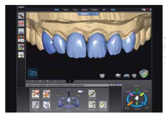
Figure 10 Final digital restorations, with "cut back" design for the microlayering of enamel ceramics.