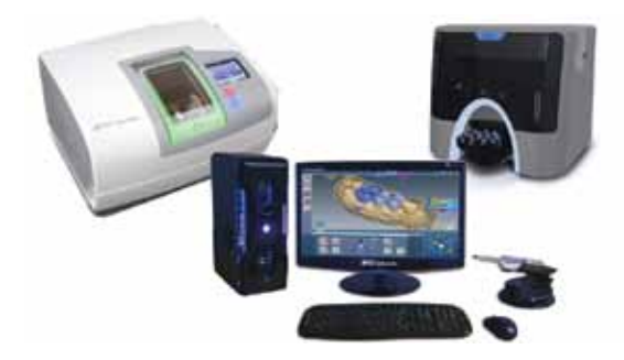
Figure 7 The E4D LabWorks system was used for the scan, design, and milling of the veneer restorations.