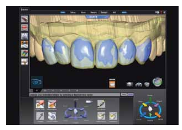
Figure 9 Computerized 3-D digital composite file, showing preparation, provisional models, and digital restoration design.

clinician's preferences. Through a variety of virtual carving and waxing tools, customization and artistry are also possible. These tools can be used to adjust occlusal anatomy, preferences, and contours, reflecting actual laboratory methods. Each step in the process is updated on the screen, therefore the effect of any changes is immediately apparent.