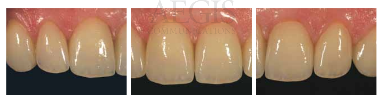
Figure 16 through Figure 18 The maxillary anterior section restored with CAD/CAM designed and milled e.max restorations, using a microlayering technique for esthetics.

volume lithium-disilicate crystals that are approximately 1.5 \ \mu m (Figure 12 through Figure 15).